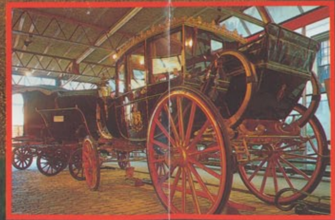
The Queen's Presents and Royal Carriages